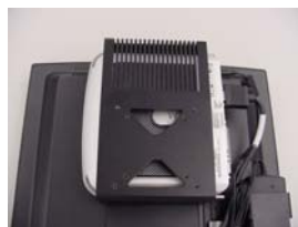
Figures 4 and 5: Slide thin client from left to right until it clicks into place.