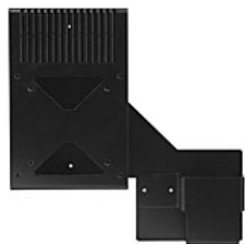
Figure 1: S-Series Bracket