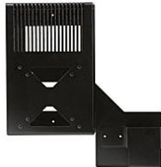
Figure 2: V-Series Bracket