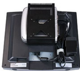
Figure 3: Fully integrated unit